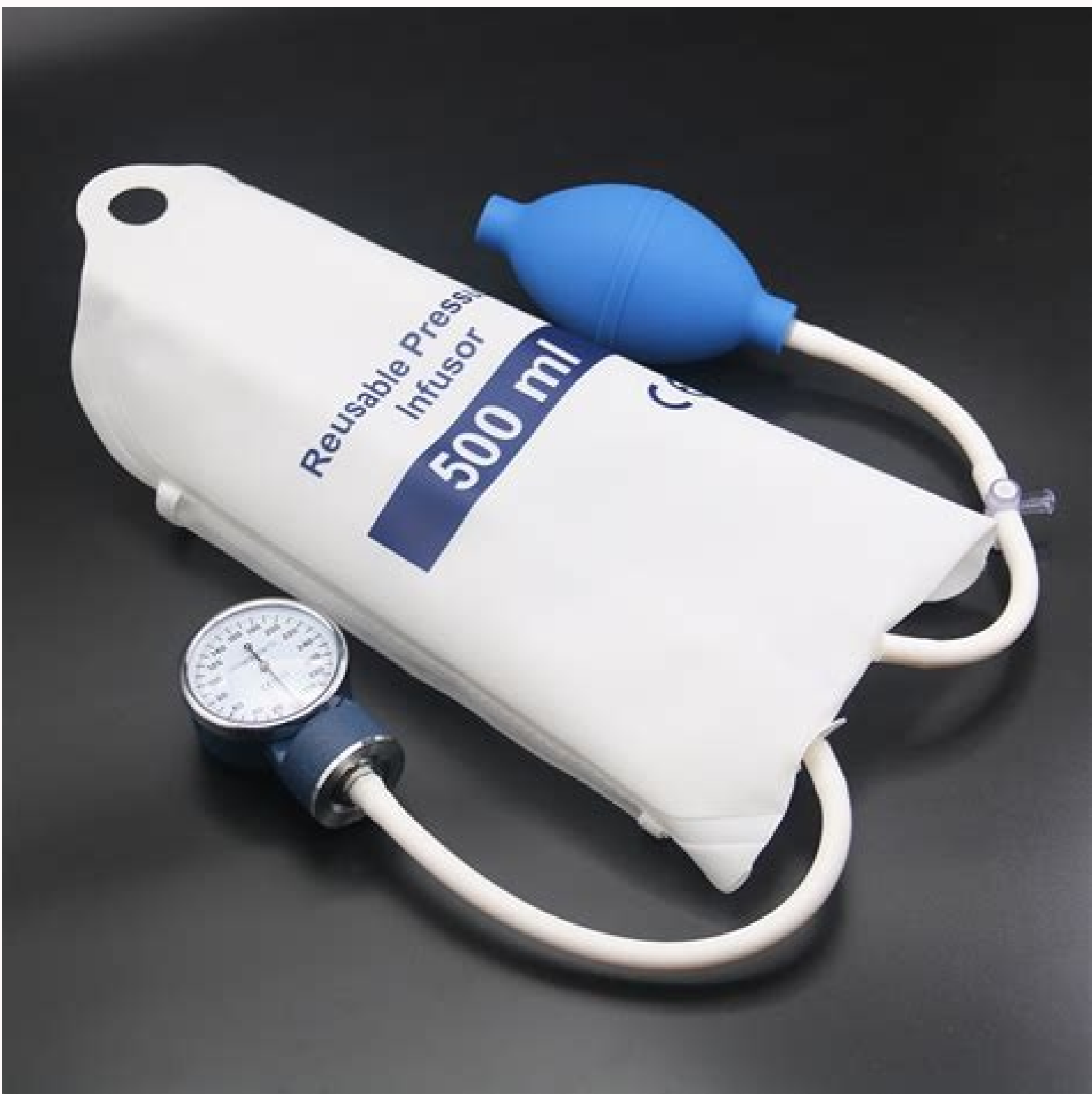
Omron blood pressure monitor manual amazon. What is the best manual blood pressure monitor.